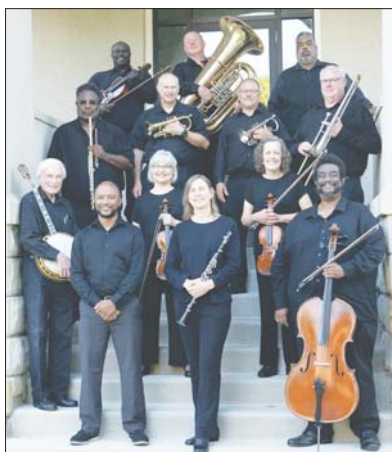
River Raisin Ragtime Revue, a 13-member Ragtime band based in Tecumseh, will perform at the TCA along with New York City-based performers June 7.

The TCA is located at 400 Maumee St., Tecumseh. Tickets are $27 at thetca.org or by calling 517-423-6617. More information on R4 can be found at ragtimeband.org .