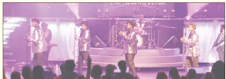
Motor City’s “The Motown Revue” will perform at Dawson Auditorium on the campus of Adrian College Friday, June 5.

Regular updates about the events will be posted on the Village of Brooklyn Facebook page.