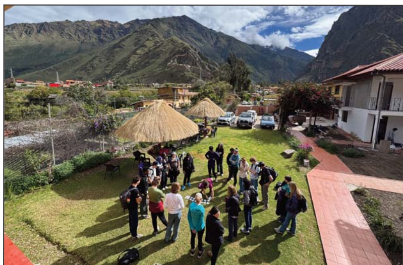
Students gather in a circle in the shadow of the mountains where they learned about the Sacred Valley Project.