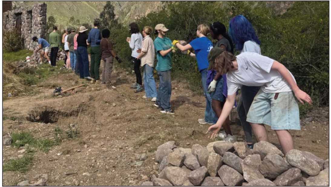
Many hands make light work - the students learned not only the value of social interaction on their trip to Peru, but of hard work and teamwork as well.

Some of the most meaningful growth came through service and challenge. Partnering with the Sacred Valley Project, a local nonprofit that supports students from remote Andean communities by providing housing, education, and opportunities to continue their schooling, students stepped into work that was unfamiliar. They learned to use new tools, to communicate through action when words fell short, and to rely on each other to get the job done. Moving rocks, clear-