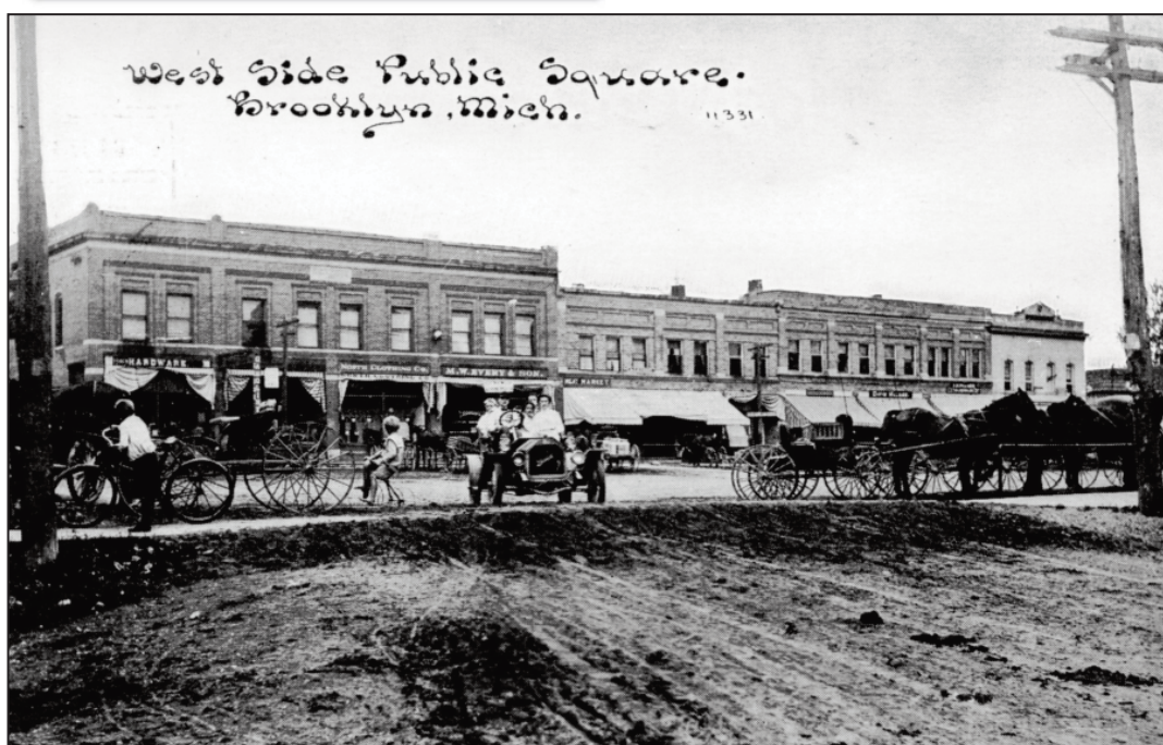
This postcard of the west side of Brooklyn's square captures three different transportation modes in the early part of the twentieth century. The car has similarities to the 1920s Ford.

If you have photos, scrapbooks, postcards, or other historical items that may be shared, we would love to see them. Contact The Exponent office to arrange a time or email unique photos with any information you have about the content to exponent@theexponent.com . In the subject line, please note for "Attic & Hearth" or "For Michelle" and include your name and contact information in the message.