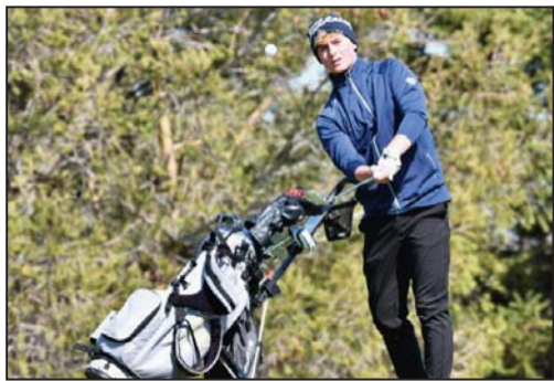
Columbia, Napoleon earn wins on the links - inside