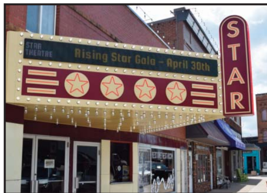
The Star Theatre in downtown Brooklyn is kicking off a major fundraising campaign to get restoration efforts going in earnest.

Brooklyn historical theatre kicks off major fundraising effort