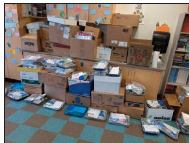
The 162 cake kits packed and ready for delivery.