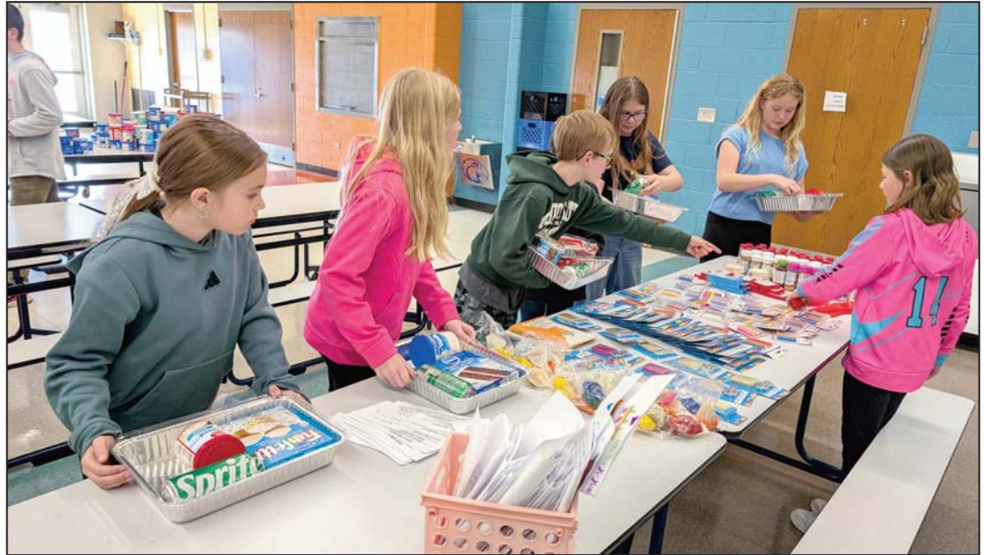
Members assembling the 162 cake kits that were collected.

Columbia Elementary Kiwanis K-Kids gather cake kits for food pantry