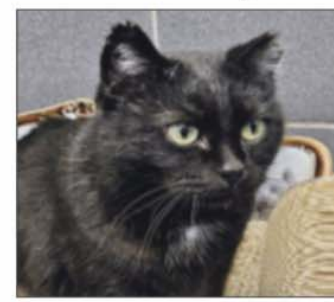
Mary Jane is a solid black, 7 year old kitty with a tiny patch of white on her chest.

3370 Spring Arbor Road • Jackson, MI 49203 Phone: 517-788-4464