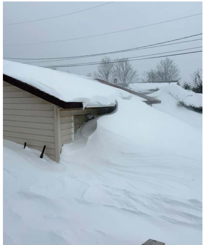
Last week's storms 'raised the roof,' so to speak, on some people's houses.

Another sign of Spring is the sound of Northern peepers. Once the weather hits 40 degrees Fahrenheit for a few days, the male peeper, which is the smallest frog in Michigan at only 1 1/2 inches long, will